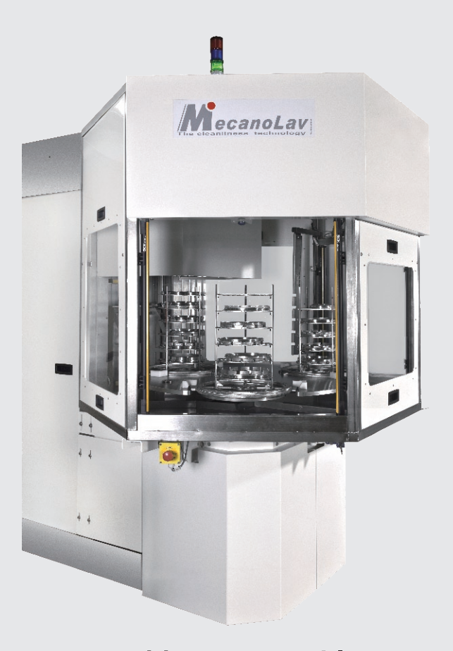
3-position rotary table