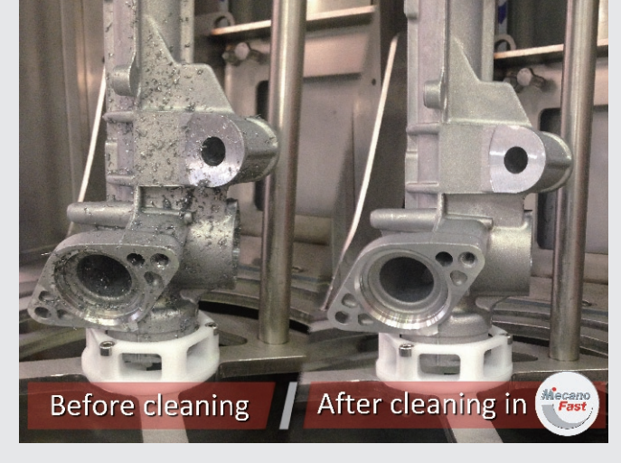
Inter-operation or final cleaning

Quality of cleaning : particular <200~400µm