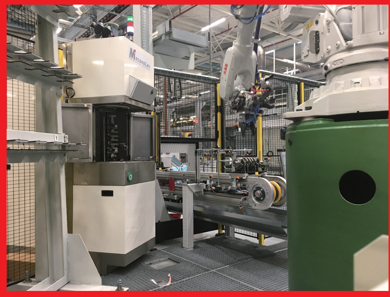
MecanoFAST in robot cell